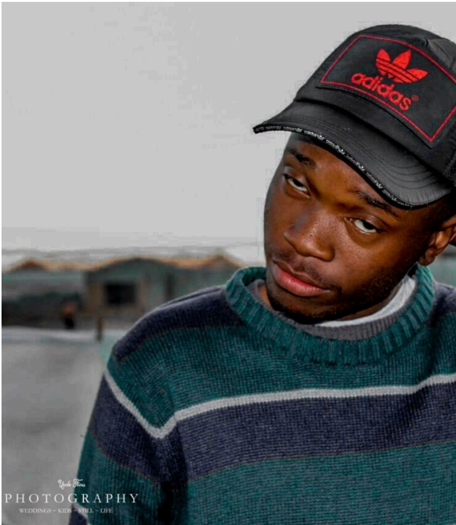
As I sit here now, my life as a bodybuilder literally unfolding before my eyes and my dreams becoming