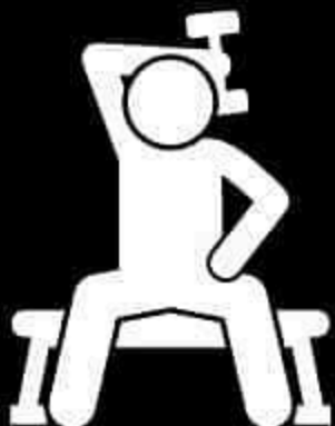
SEATED TRICEP DUMBBELLS