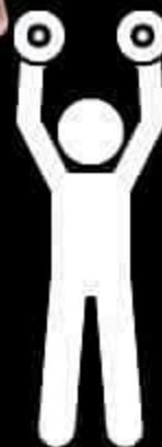
OVERHEAD DB PRESS