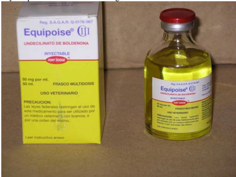
Desoxytestosterone Acetate. I

Desoxy-Testosterone DesoxyTestosterone is a very interesting steroid, and it also goes by the name of 2-Delta, and contains 5alpha-androst-2-ene-17-one, a pretty inactive substance, which has to be converted in the body into 5alpha-androst-2-ene-17-ol. It is available as Acetate, or Cypionate. The acetate ester will enhance solubility significantly and intramuscular injections into subjects have produced remarkable results compared to testosterone. Anecdotal reports of Desoxy-T Acetate appeared to yield positive outcomes with insignificant undesirable effects inside the four week cycles.