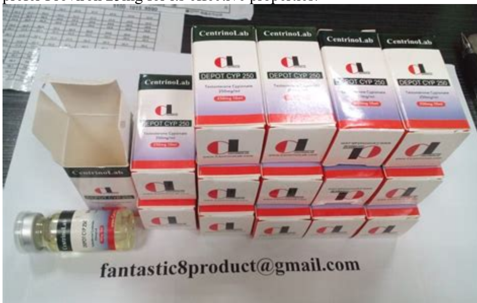
Initiation of management: 1

Description. Proviron 25mg is an oral product that is often used by bodybuilders in a steroid cycle. The active substance of this medication is Mesterolone. Original Proviron 25mg is produced by the world famous brand Alpha Pharma. Packing of this product includes 25 mg (50 pills). Professional athletes prefer Proviron 25mg for its effective properties.