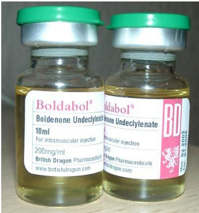
Proviron 25. What is Proviron?

Mesterolone, known also by the brand name Proviron, is a compound that's very similar to Masteron - as you might be able to tell from their similar names. Mesterolone is an orally active compound that's similar to dihydrotestosterone. Specifically, it's a 1- methylated dihydrotestosterone molecule.