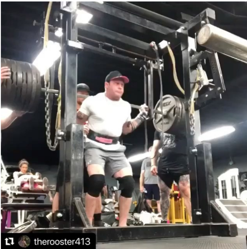
I think that it's really important to note right now, during conversations about mental health, suicide prevention, and the abolition of oppressive systems: