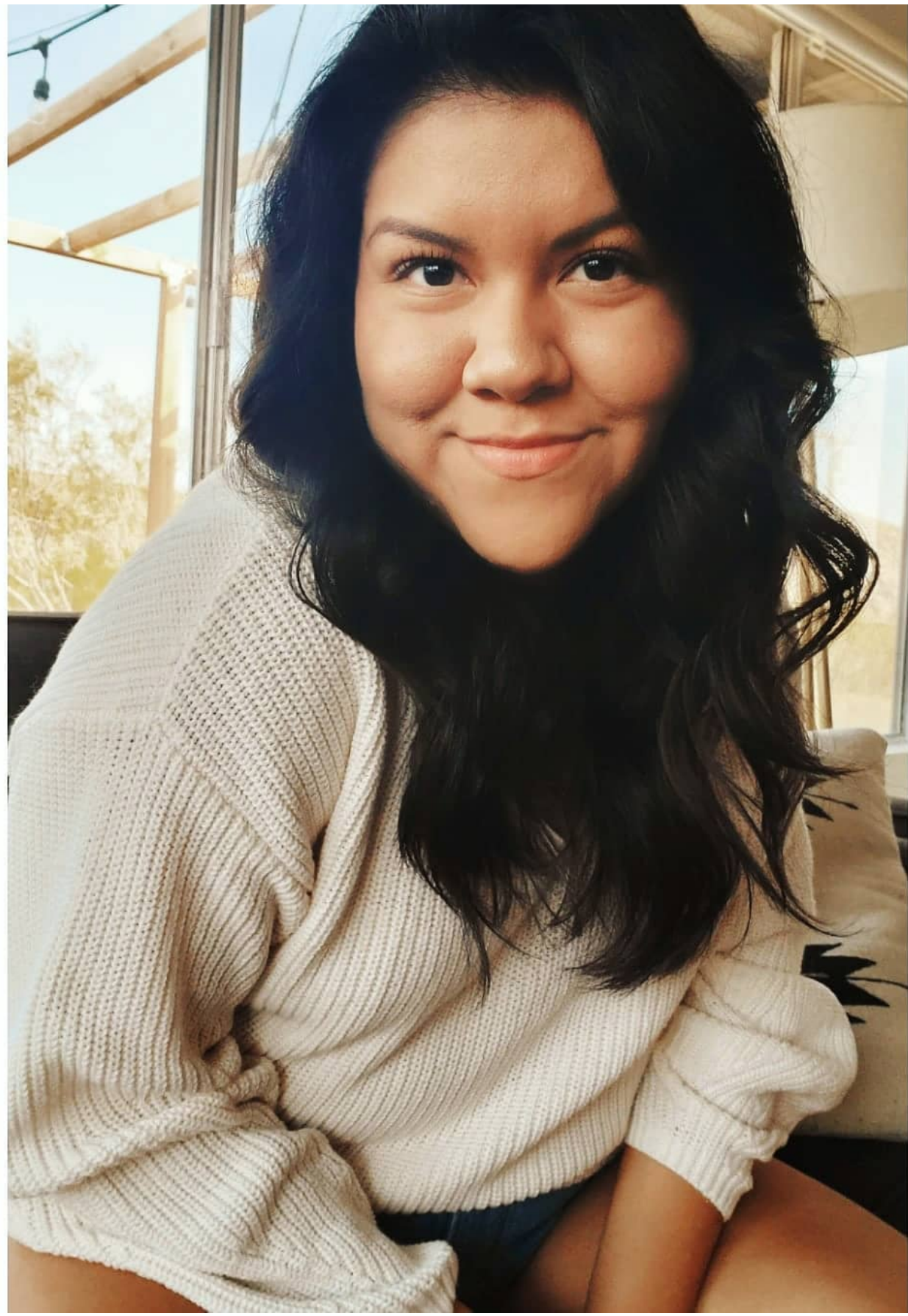
Battlefy is the simplest way to start, manage, and find esports tournaments | Create. Compete. Conquer.