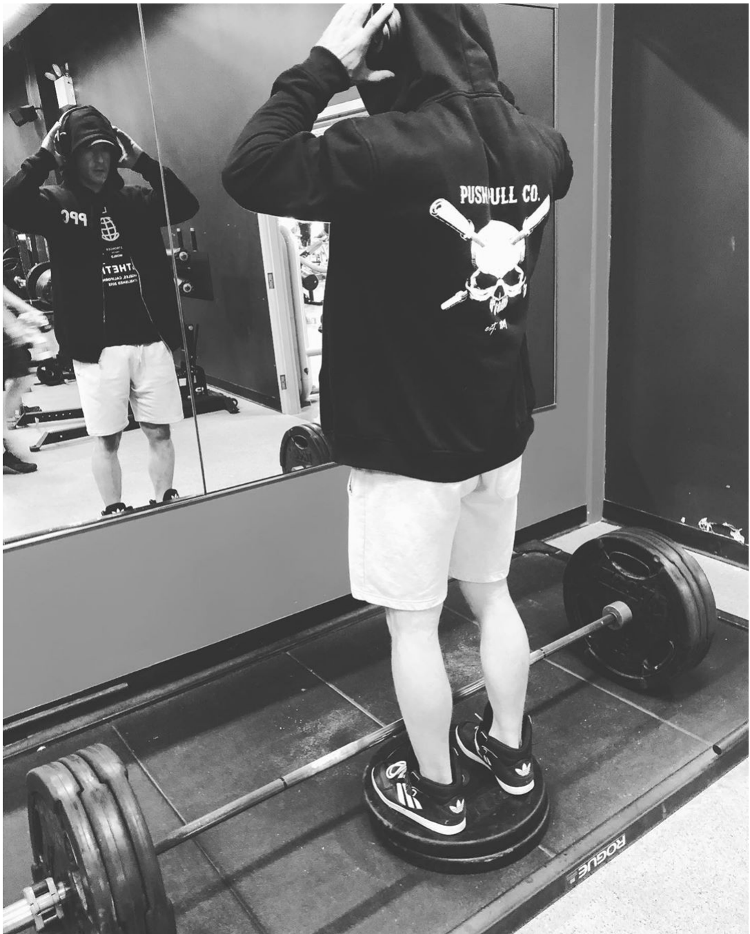
#emom #crossfitter #covid #crossfitgames #crossfitopen #burpee #thruster #crossfitaddict #gym #weightlifting #olympiclifting #workout #1rm #functionaltraining #snatch #cleanandjerk #toestobar #burpee #HWPO #metcon□□□□□□