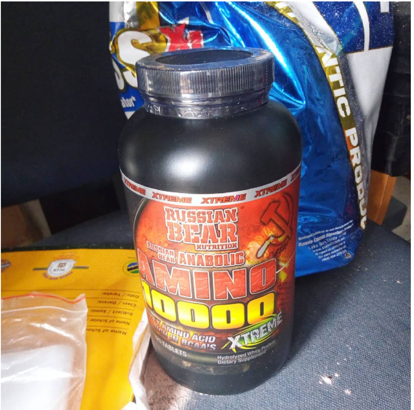
Just uploaded a new podcast all about the difference in being competitive/comparing & collaborating. (So glad you guys are enjoying the feminine energy ones!!) ☐☐