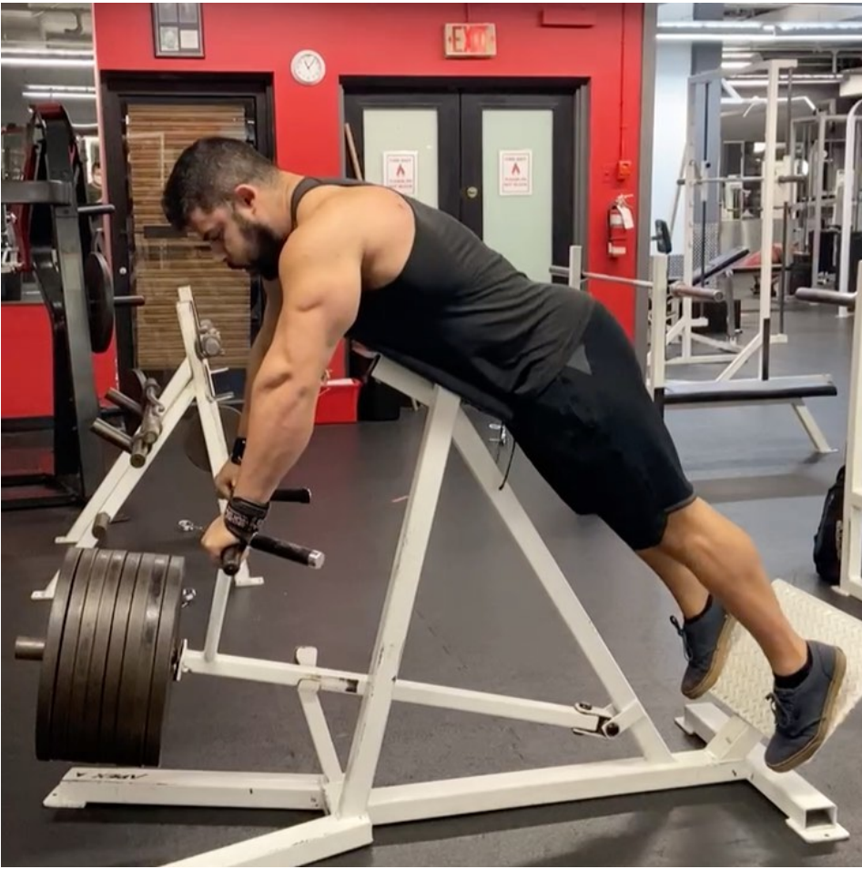
Product: Stanozolol 80 Manufacture: Elite Pharm Quantity: 80 mg/ml Pack: 10 ml Steroid cycle: cutting, bulking Active substance: Stanozolol