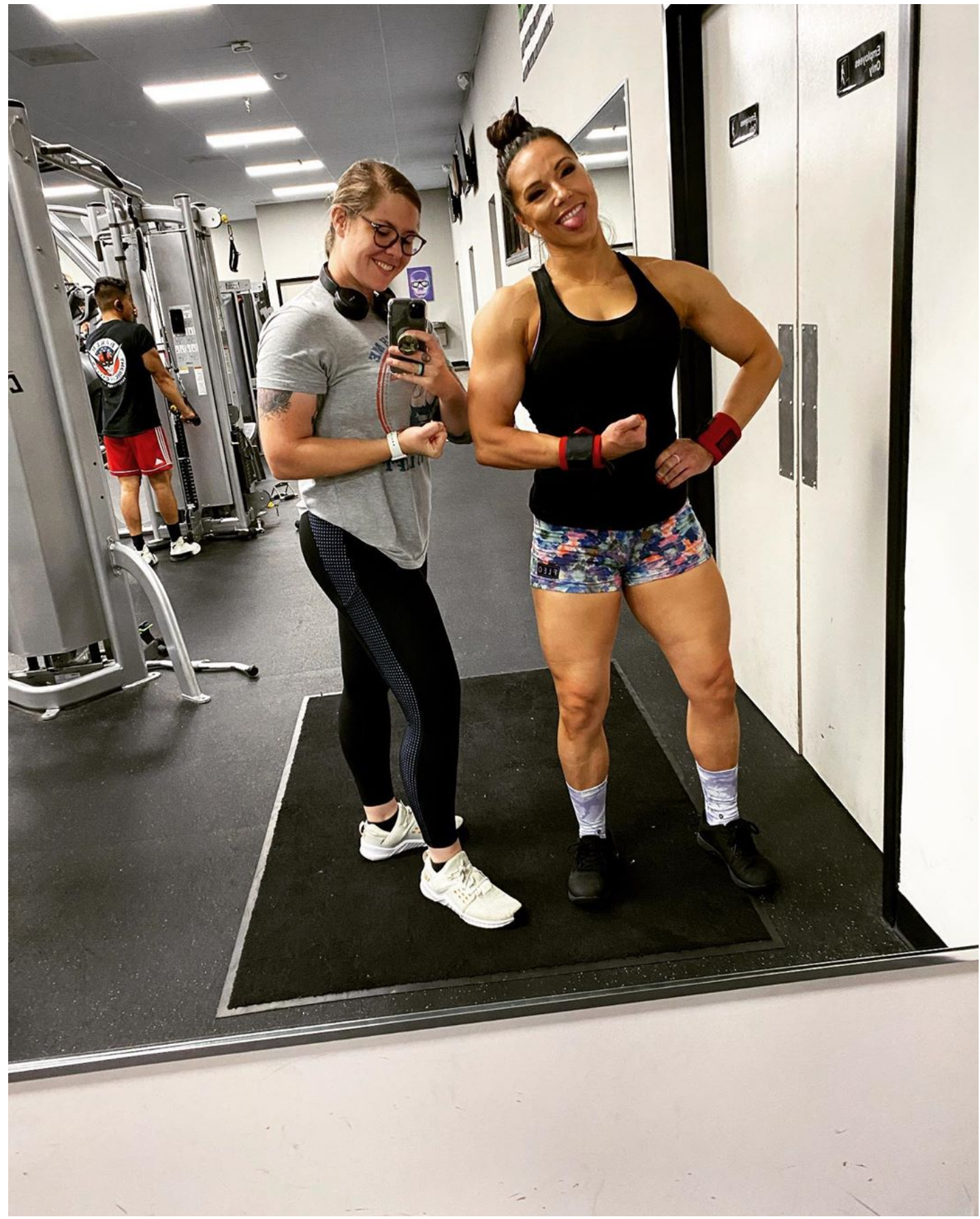
#lockdown #fitness #gym #workout #legday #bodybuilding #powerlifting #fitnessmotivation #lifting #fitfam #deadlift #motivation #training #fit #gymlife #squat #highbarsquat #muscle #quads #strength #strong #deadlifts #beastmode #exercise #timeundertension #legs #gymmotivation #strengthtraining #beastmode #jdgyms #instafit