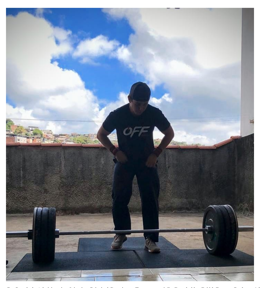
Get Sustabol . Administration: Injection. Principal Constituent: Testosterone Mix. Branded by: British Dragon. Package: 1 X 10 ml. Real Testosterone Decanoate, Testosterone Isocaproate, Testosterone PhenylPropionate, Testosterone Propionate source's review online. Click this site to read how to purchase Sustabol safely by using reliable Buysteroids.biz dealer where bodybuilders could share ... Today was leg day!! Ended with some single leg leg press and fictional training. Great way to end!! Excuse the sweat but your girl was pushing it today!