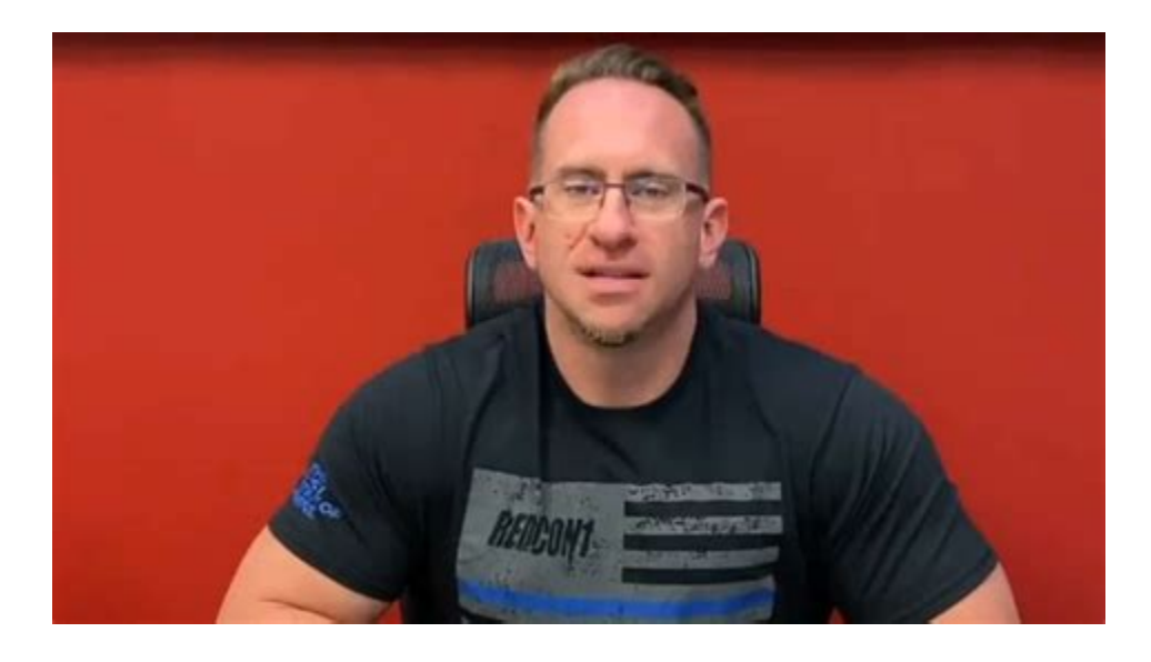
On Jan. 27, Aaron Singerman, who co-founded and operated Blackstone Labs with Braun, was sentenced to 54 months in prison and ordered to forfeit $2. 9 million. In total, eight individuals and three companies were convicted in connection with the activities of Blackstone Labs.