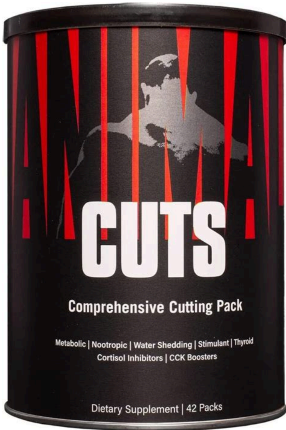
Table of Contents SARMs for Cutting Just as some anabolic steroids are most effective for bulking up or for cutting than others, the same applies to SARMs. Some SARMs excel at helping preserve lean muscle and even directly assisting in burning fat, while others are much more suited for building muscle.