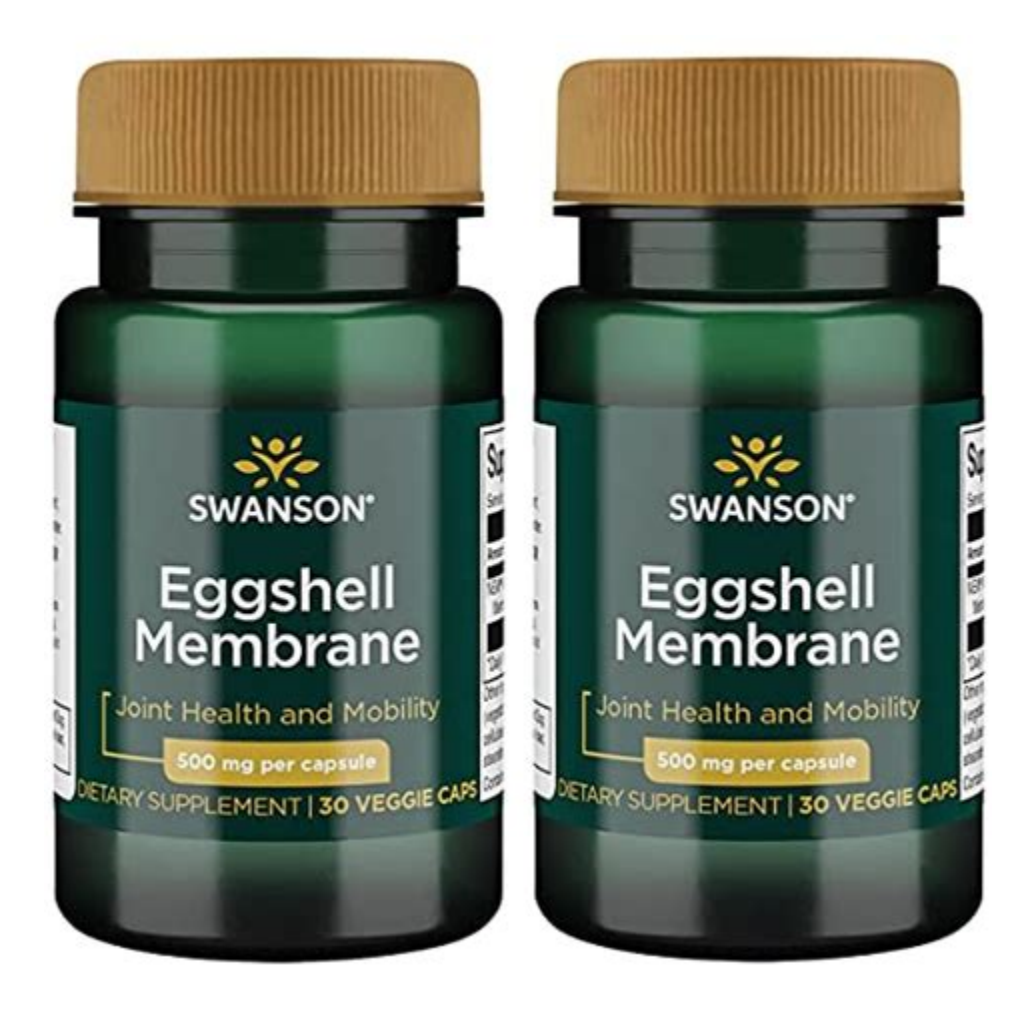
Top 6 Best Eggshell Membrane Supplements in 2023

Eggshells are roughly 40% calcium, with each gram providing 381-401 mg (2, 3). Half an eggshell may provide enough calcium to meet the daily requirements for adults, which is 1,000 mg per day.