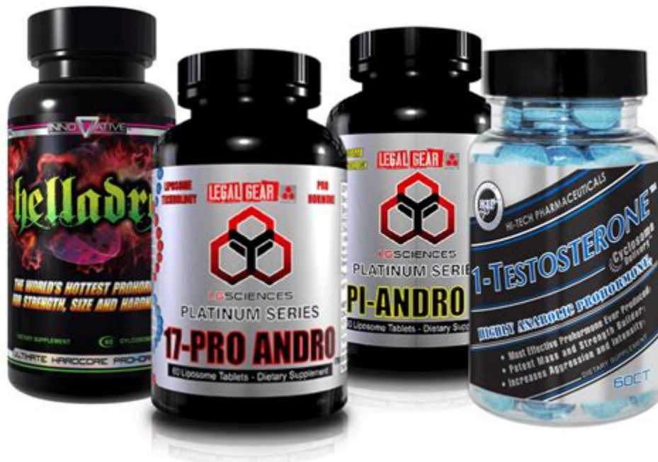
Table of Contents View All What Are Prohormones? Are They Legal? Do They Actually Work? Side Effects Safety Performance-enhancing drugs (PEDs) are often used inside gym walls, during