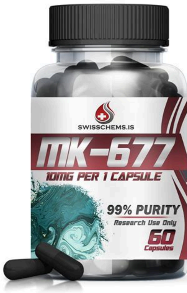
Table of Contents MK-677 History and Overview MK-677, also commonly called Ibutamoren, is one of the more well researched compounds that bodybuilders use. This is not a SARM, even though it's often confused as one. MK-677 is a very different type of compound and one that doesn't act on androgen receptors at all. MK-677 (Ibutamoren) History