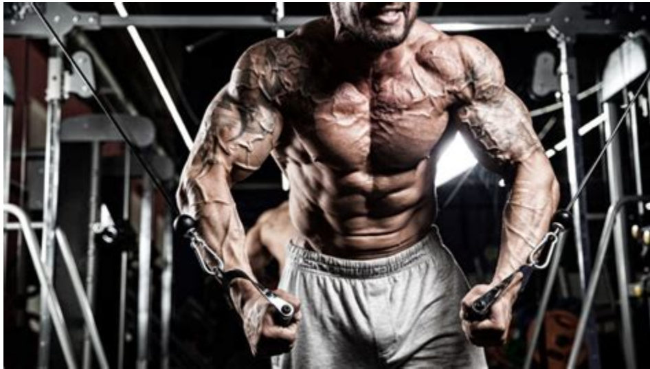
Table of Contents 1 What is Epistane? 2 Who Should Use Epistane? 3 What is Epistane Best For? 4 How Fast Can You Expect Results with Epistane? 5 What is the Best Epistane Dosage? 6 What's The Best Cycle Support for Epistane? 7 What is the Best PCT for Epistane? 8 What is Epistane Stacked With? 9 Epistane Overview WHAT IS EPISTANE?