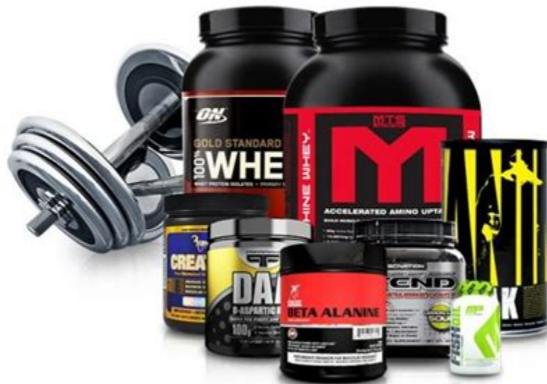
Table of Contents Do Prohormones work in 2023? The best prohormones for bulking and mass in 2023