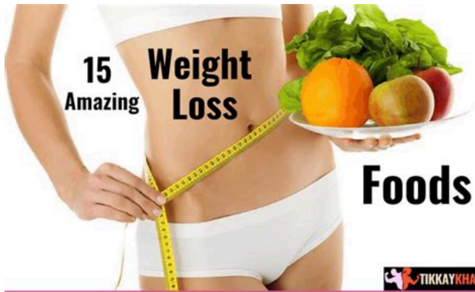
Cruise Control Diet