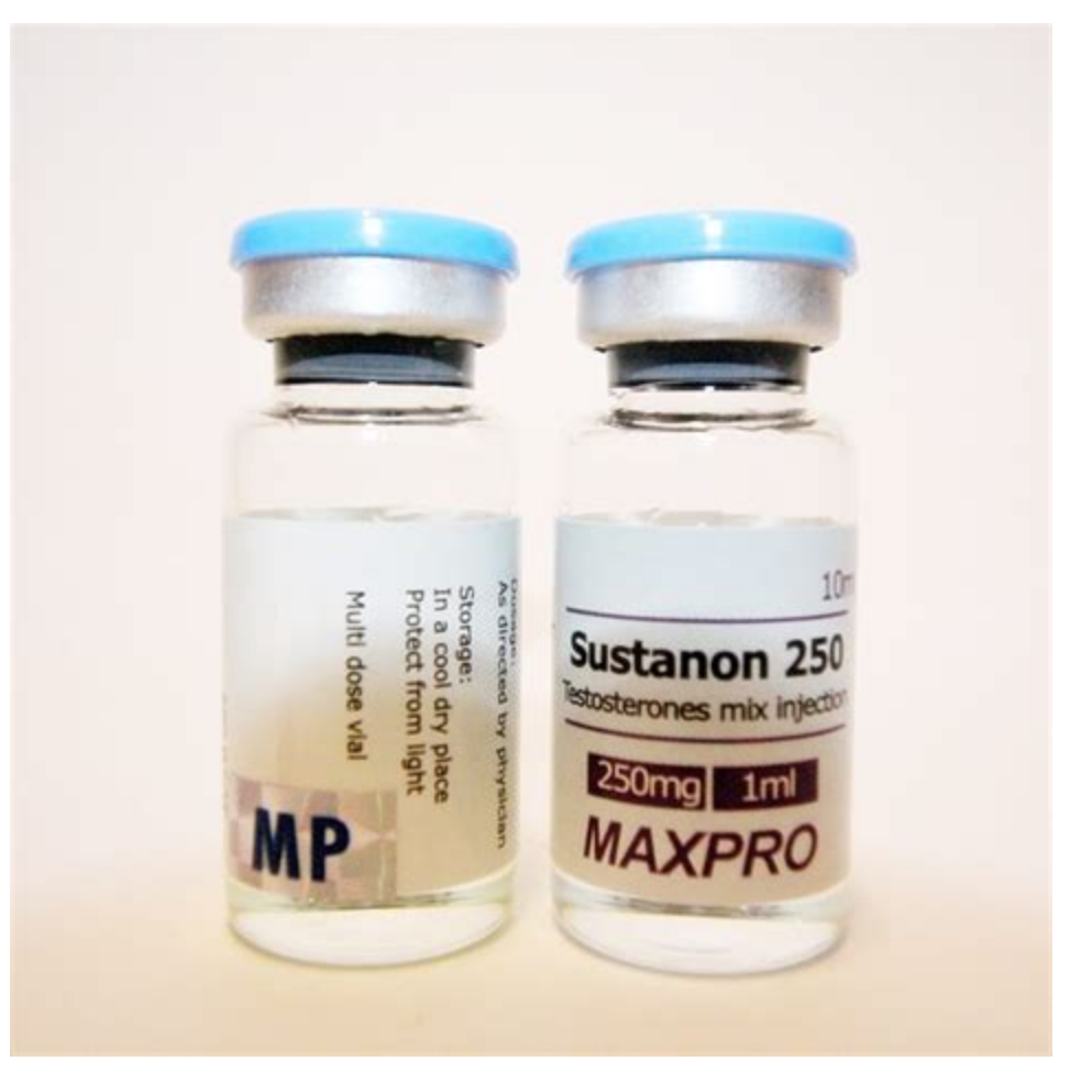
Steroids for SALE in USA. Buy oral and injectable steroids online. DBOL, Clen, Tren, HGH, Winstrol from legendary brand like: British Dragon, Axiolabs and Dragon Pharma. Bitcoins - Accepted <a href="more hints">more hints</a>