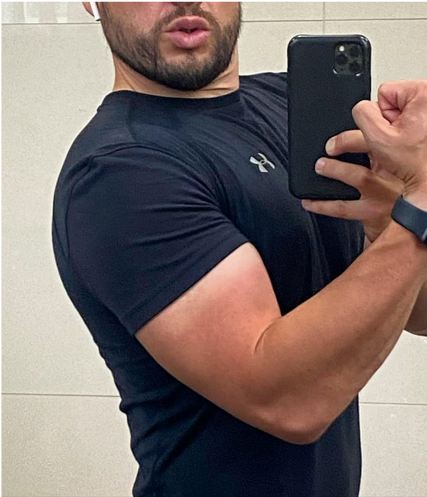
nevido fiole prospect