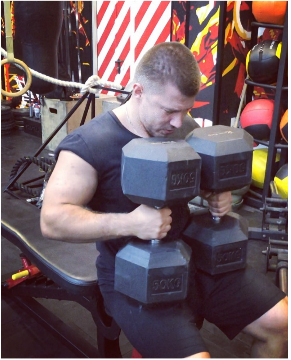
Dianabol is a C17-alpha alkylated anabolic steroid, and as a result, carries a hepatotoxic nature. The rate of hepatotoxicity can vary greatly from one C17-aa steroid to the next, and while Dbol is far from the most toxic, we can't call it mild either.