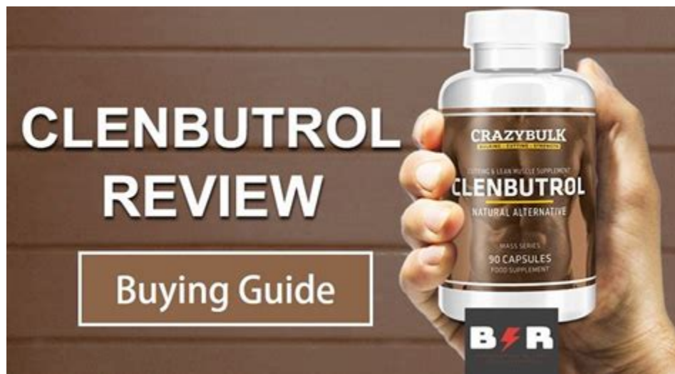
Table of Contents What is Clenbuterol Is Clenbuterol Legal in the US? Is Clenbuterol Legal in the UK? Is Clenbuterol Safe? Reported Health Dangers Is Clenbuterol a Steroid or Not? Does Clenbuterol Work for Losing Weight? Clenbuterol Effects - Short-term and Long-Term Results Clenbuterol for Women Clenbuterol for Cutting