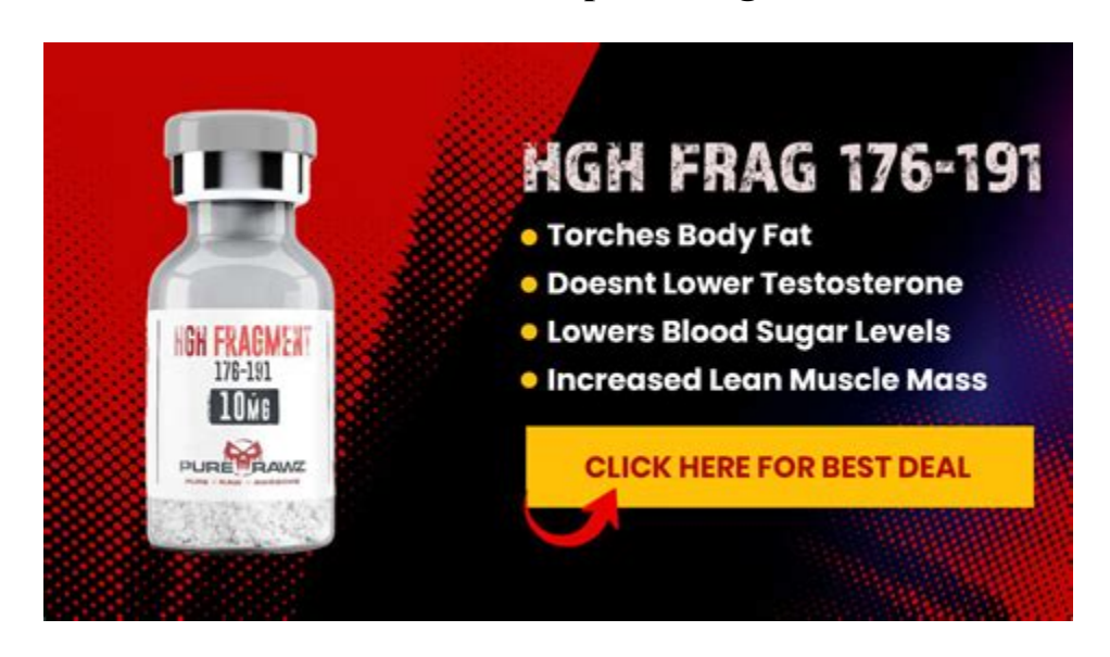
Frag 176-191: Benefits & Side Effects + Proper Dosage Protocol

Substance: HGH Fragment 176-191 Manufacturer: Hilma Biocare Pack: 1 vial of 5mg