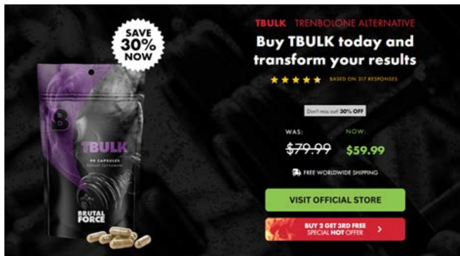
Table of Contents WHAT IS TRENOROL? WHAT DOES Trenorol DO IN ME? WELL, WHO CAN TAKE TRENOROL? HOW SHOULD I TAKE TRENOROL? WHAT IS TRENOROL? TRENOROL is the legal alternative for Trenbolone, the godfather of the steroids! If you have TRENOROL, you have everything for building up your body.