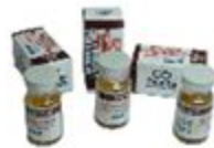
GP Tren Enanth 200 Manufacturer: Geneza Pharm...