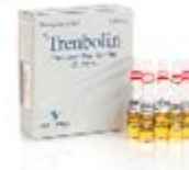
Trenbolin Manufacturer: Alpha-Pharma