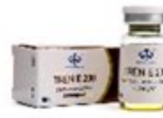
Tren E 200 Manufacturer: Maha Pharma