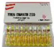
Tren Enanth 200 Manufacturer: Singal Pharma