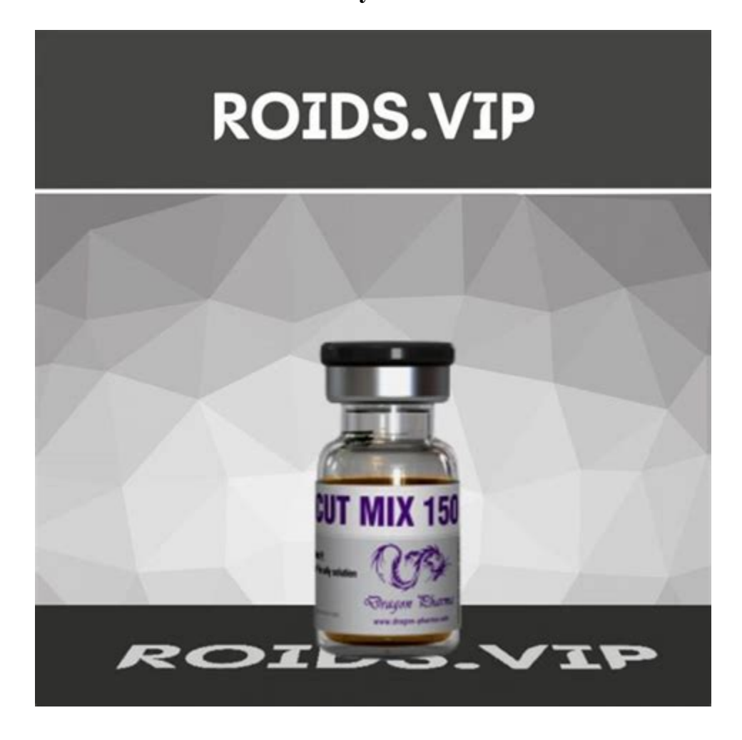
Cut Mix 150 - STEROIDS-USA. NET buy Cut Mix 150 online with credit card

Overview. Have an olfactory journey when you book this small group tour in Paris that lets you make your very own perfume, and also takes you on a tour of the Fragonard Perfume Museum. This tour will have no more than 10, so you can feel free to ask your guide anything you'd like, or ask for assistance in making your fragrance.