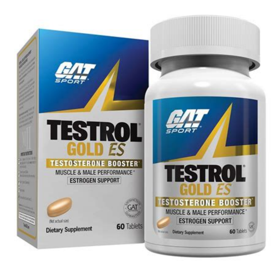
Top 5 Testo Boosters to Buy in the Philippines (Updated 2022)

Where to go for testosterone in the Philippines Support I started testosterone two years ago. The place where I am treated is a hospital and the doctors always give me injections. I want to continue my treatment while I'm in the Philippines for a long period of time, but I have no idea where or how they are doing it.