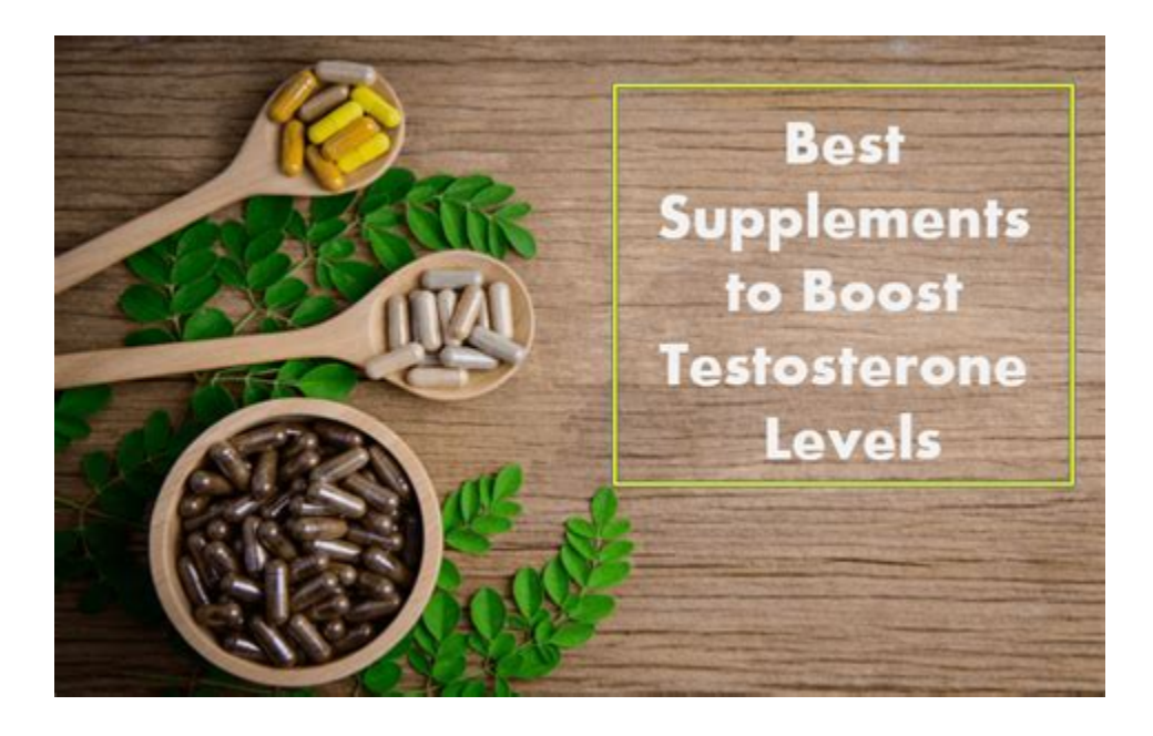
The 4 Best Supplements to Boost Testosterone Levels - Healthline

If you want to buy steroids in the Philippines, there are a few places you can check out. You can try your local gym, supplement store, or even online retailers. However, before you make your purchase, there are a few things you need to keep in mind. Bulking agents like testosterone can be used to bulk up 10-15 pounds of lean muscle in 30 days.