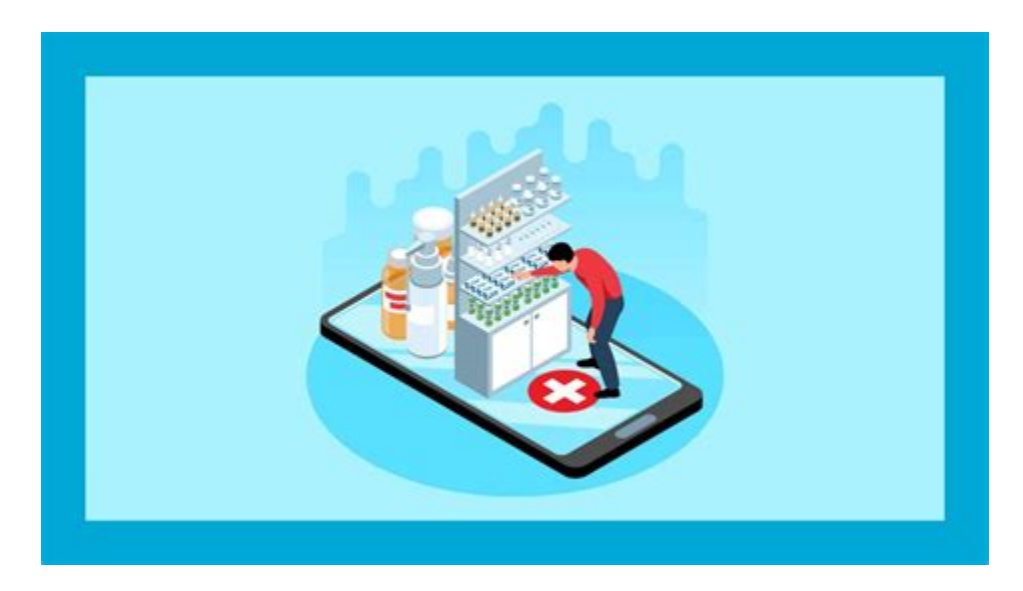
MRP ₱ 31. 36. ₱ 33. 26. Getmeds Philippines Incorporated. Ang parmasya ng pilipinas. Getmeds Philippines Incorporated is an online pharmacy with a one-stop destination for all types of medicines and healthcare products. Getmeds Philippines Incorporated allows you to choose from 10K+ products including, Over-the-counter medicines, mom and baby.