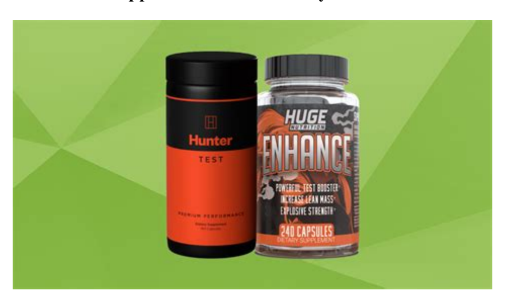
The 7 Best Testosterone Supplements of 2023 - Verywell Fit