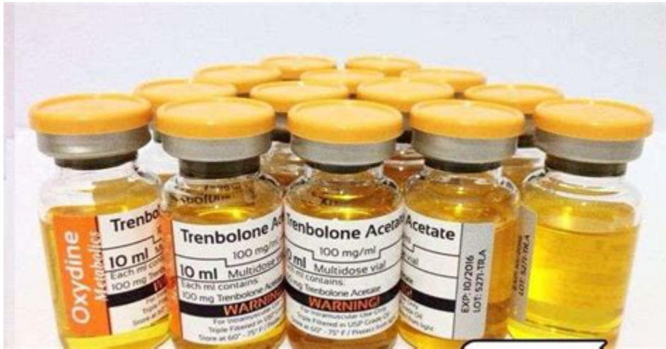
Table of Contents Trenbolone History and Overview Trenbolone is recognized as the strongest anabolic steroid available. It's a steroid that is not one to be used by beginners and is usually only used by advanced steroid users, or at least those who have several other steroid cycles under their belt already.

How to Buy Trenbolone in the USA: Real Tren Steroid for sale - NDTV.com