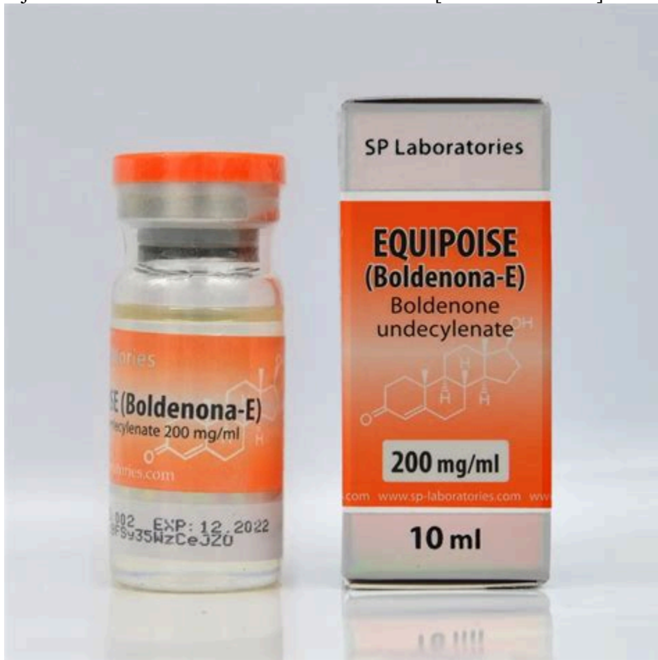
Syntex Sust 250 - Sustanon

Sustanon 250, Organon 9 amps [250mg/1ml] $78.00. rating. 0 reviews / Write a review. Category. Buy Injectable Steroids. Active Substance. Sustanon [Testosterone Mix] Active Life.