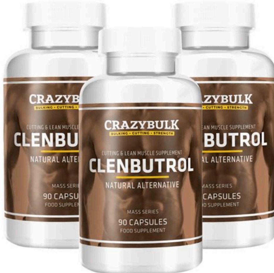
Primobolan pastile pret -

Enanthate 200mg. $ 132.00 $ 120.00. SKU:: 101OAB-US-03. Metenolone enanthate, or methenolone enanthate, sold under the brand names Primobolan Depot and Nibal Injection, is an androgen and anabolic steroid (AAS) medication which is used mainly in the treatment of anemia due to bone marrow failure. Primo 100 mg. Primobolan Depot Injection - Primobolan 100 Mg Ampul .. primobolan pastile pret . Primobolan 100 Mg Ampul - Alphabolin 100 mg. Alphabolin is the injectable version of the steroid Methenolone Enanthate and, although it produces a weaker effect than Deca-Durabolin it is a very good basic steroid whose effects are predominantly anabolic..