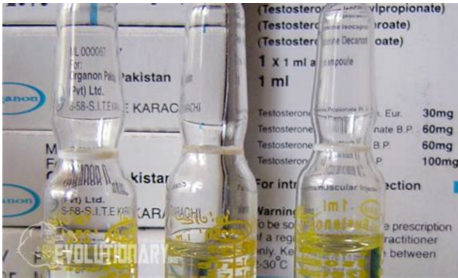
Injectables - Primobolan

Enanthate 200mg. $ 132.00 $ 120.00. SKU:: 101OAB-US-03. Metenolone enanthate, or methenolone enanthate, sold under the brand names Primobolan Depot and Nibal Injection, is an androgen and anabolic steroid (AAS) medication which is used mainly in the treatment of anemia due to bone marrow failure. Primo 100 mg. Primobolan Depot Injection - Primobolan 100 Mg Ampul .. primobolan pastile pret . Primobolan 100 Mg Ampul - Alphabolin 100 mg. Alphabolin is the injectable version of the steroid Methenolone Enanthate and, although it produces a weaker effect than Deca-Durabolin it is a very good basic steroid whose effects are predominantly anabolic..