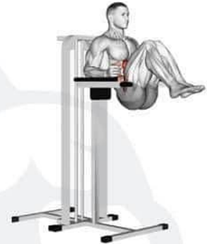
CAPTAIN'S CHAIR KNEE TUCKS