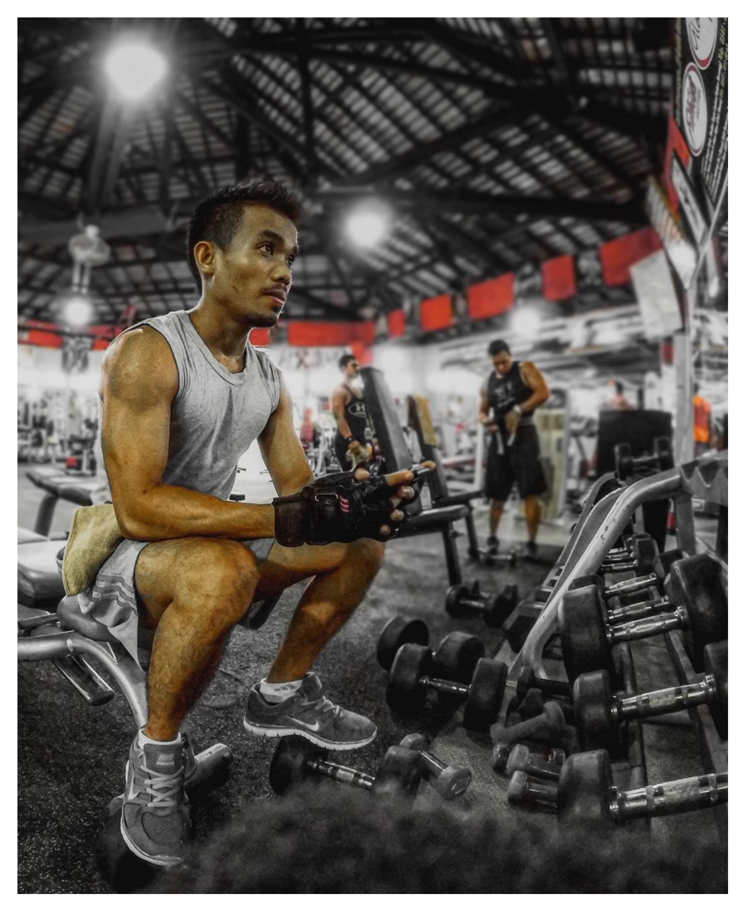
Trenbolone Hexahydrobenzylcarbonate 76.5 mg. Indications. Parabolin is indicated in treatment of severe muscular dystrophy and severe unrelated muscular catabolism as well as acute growth failure. Presentation. Each carton contains 5 ampoules of 1.5 ml (76.5 mg/1.5 ml) ©2008 Alpha-Pharma Healthcare ...