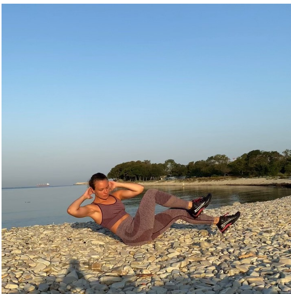
I love to add AMRAPs into workouts because they get your heart rate up quickly and if you're competitive like me you can get a pretty solid workout in without having to commit a massive amount of time. Also clutch if you've got a five month old who hates taking a nap longer than 20 minutes. Yay for home workouts in tiny spaces.

https://mndepted.instructure.com/eportfolios/6974/Home/Clembuterol_Brontel_Comprar