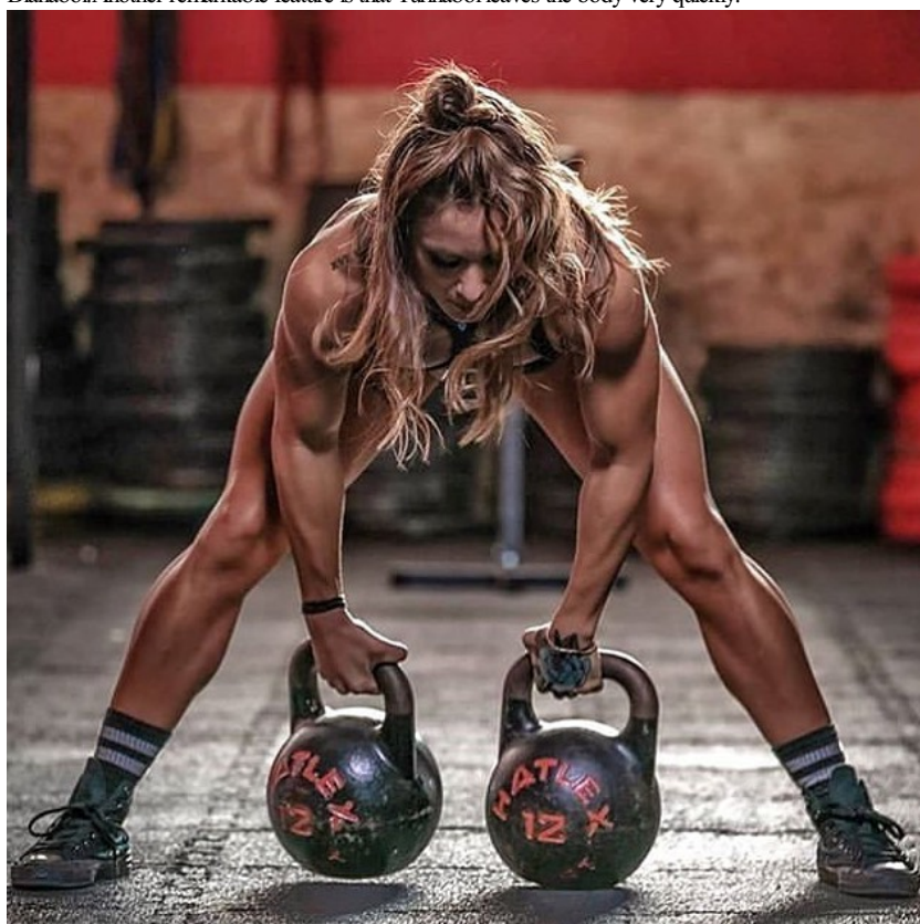
This week when my friend signed into my transmasculine support group he sent me a message that said "OMG! I can really see the changes from T just from the past two weeks." I'm so happy to hear that my appearance is changing.