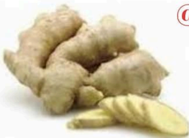
GENGIBRE acelera o metabolismo