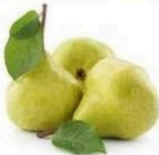
PERA rica em fibras milagrosas