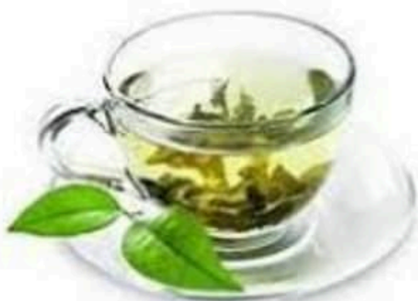
CHÁ VERDE acelera o metabolismo