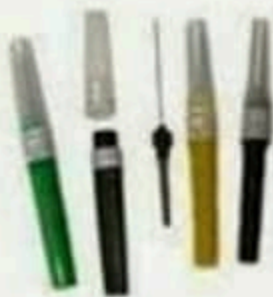
Multi Sample Needle