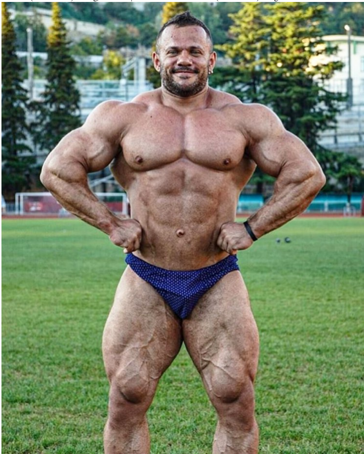
Los músculos antagonistas siempre trabajan en sinergia: cuando uno de los músculos se contrae, el otro se relaja. El ejemplo más común de músculos antagonistas son los bíceps y los tríceps. A medida que el musculo agonista se contrae, el antagonista se relaja, ayudando a controlar y regular el movimiento del primero.

SSN Black Dragon D-BOL 10 mg, 100 Tablets 2.5 out of 5 stars 11 ₹ 799.00 ₹ 799.00 RawRage DIANA-10 Ultimate Size Gain Formula Helps Gain Mass 4.3 out of 5 stars 42