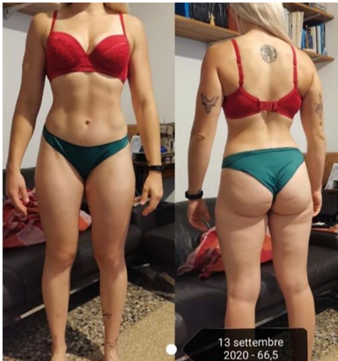
13 settembre 2020 - 66,5