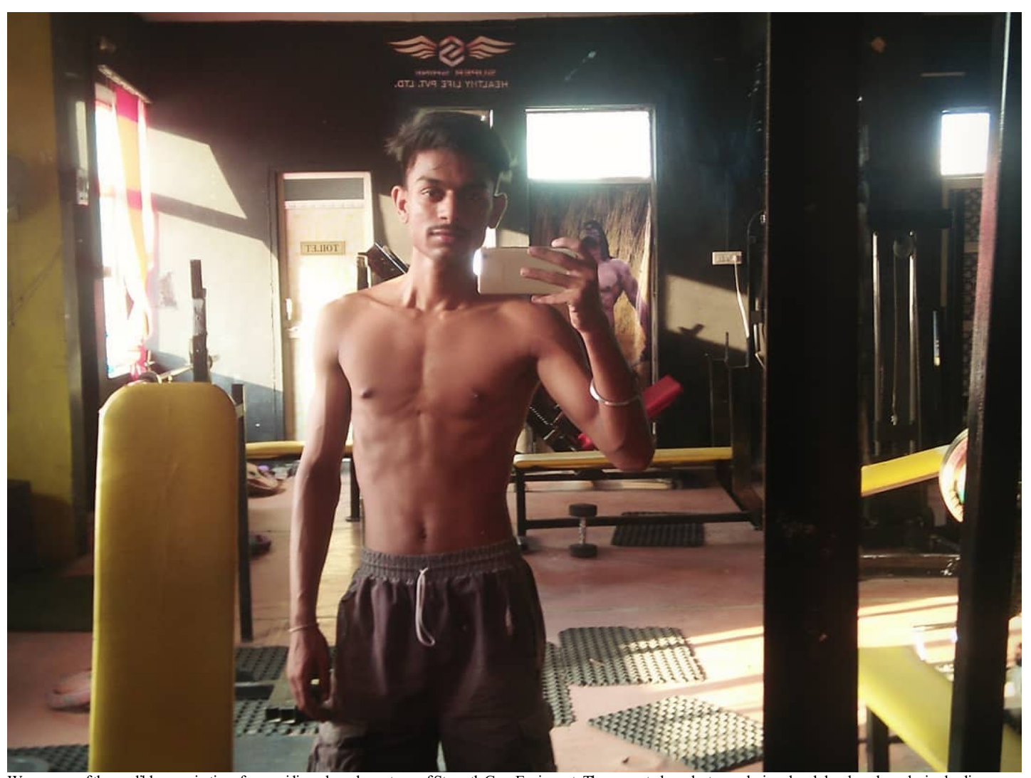
We are one of the credible organizations for providing a broad spectrum of Strength Gym Equipment. The presented products are designed and developed employing leading-edge technology and standard components that make them at par with industrial standard quality consequently ensuring their high strength and long life.