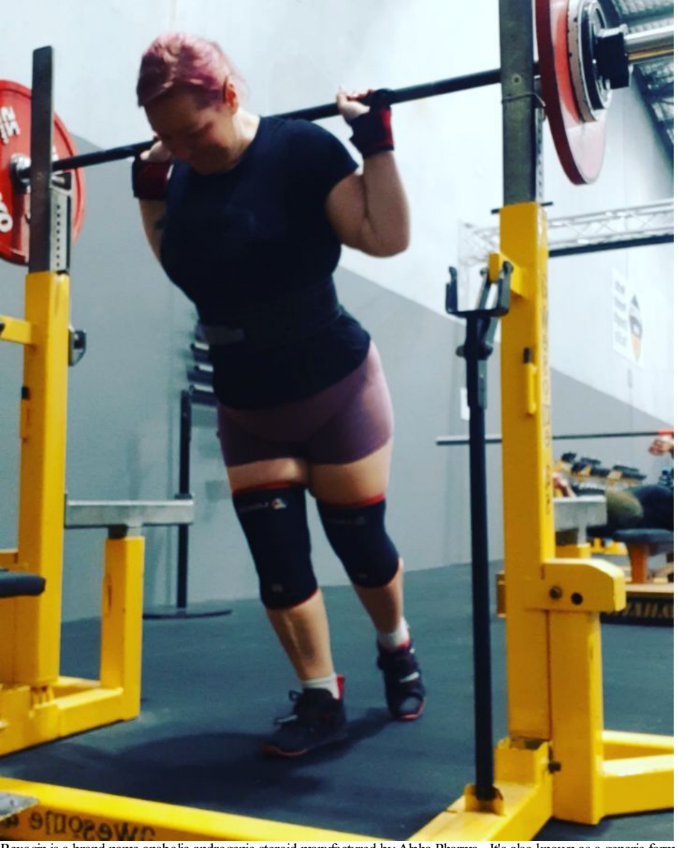
Rexogin is a brand name anabolic androgenic steroid manufactured by Alpha Pharma.. It's also known as a generic form of Winstrol (Stanozolol). Before using any generic or brand name steroid, learn how it functions in the body and how it may benefit bodybuilding and athletic performance enhancement.