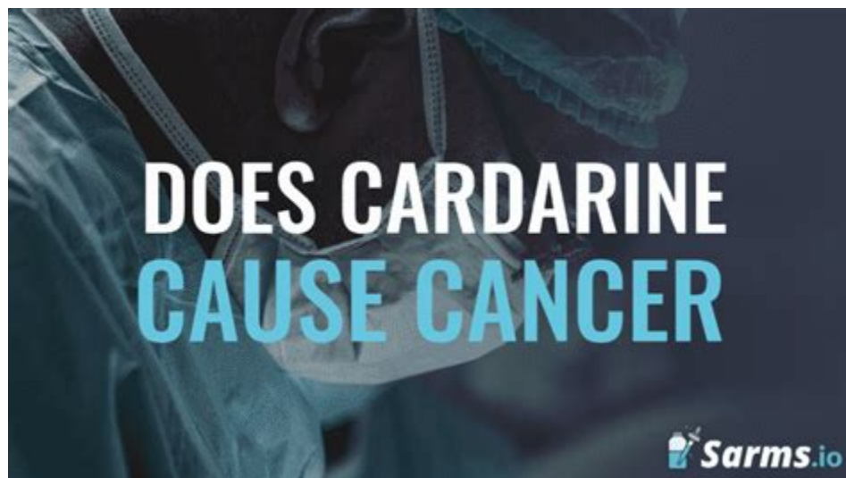
Table of Contents What is Cardarine (GW501516) Cardarine is usually lumped into the SARM category of substances, but technically it is a PPAR receptor agonist. This class of drugs is designed to treat metabolic syndrome symptoms by lowering blood sugar and triglycerides (fat lipids in the blood). Cardarine GW-501516 Structure