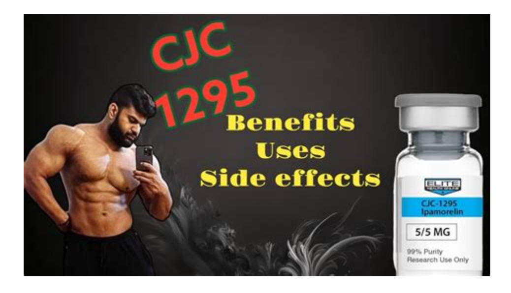
CJC 1295: Benefits, Side Effects, Dosage & Where to Buy

CJC-1295 has been shown to elevate plasma growth hormone by 2 times to 10 times for 6 days, and plasma IGF-1 levels by 1. 5-3 times for up to 9-11 days with a single dose.