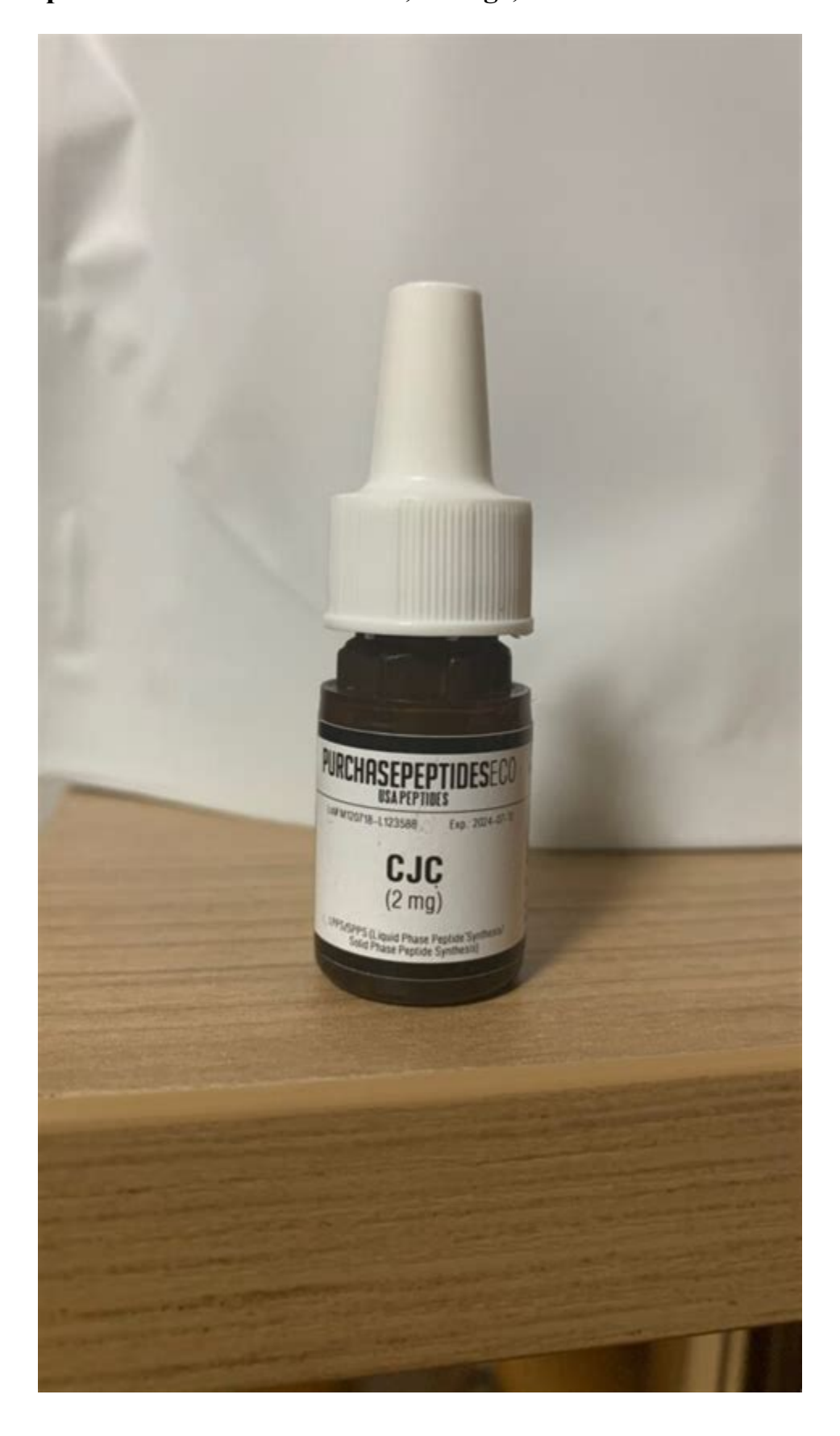
CJC-1295 Peptide Review Guide- Effects, Dosage, Side Effects