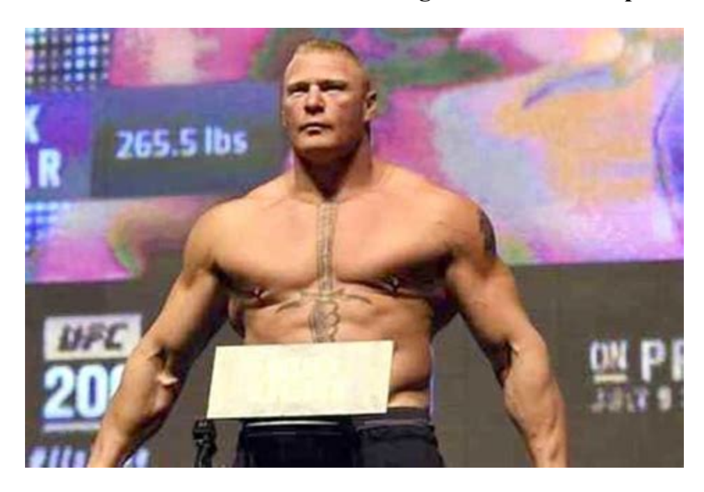
January 4, 20172:53 PM PSTUpdated 7 years ago. (Reuters) - Former UFC heavyweight champion Brock Lesnar has been suspended for one year for a doping violation, the United States Anti-Doping Agency.