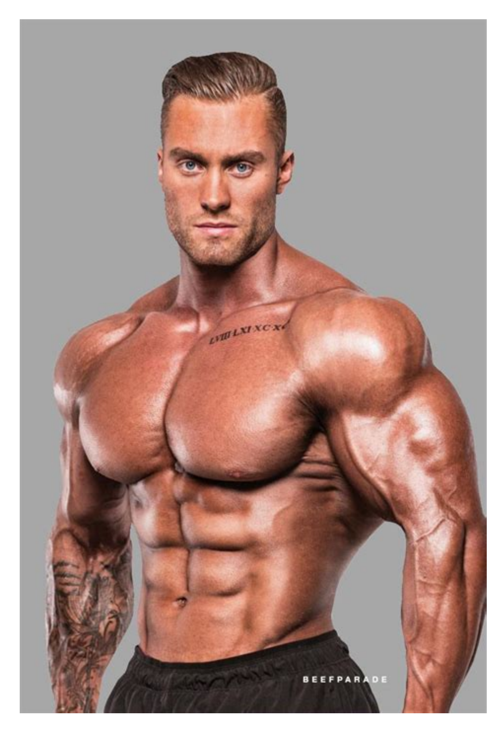
Natty or Arti: Is Chris Bumstead Natural or on Steroids? - Muzcle

Looking to bulk up safely and legally? Look no further than CrazyBulk's Bulking Stack. This powerful combination of safe, legal steroid alternatives will help you see results within just 30 days. Needles and prescriptions not required! Simply take the Bulking Stack orally and watch your muscles rapidly grow and recover in record time.