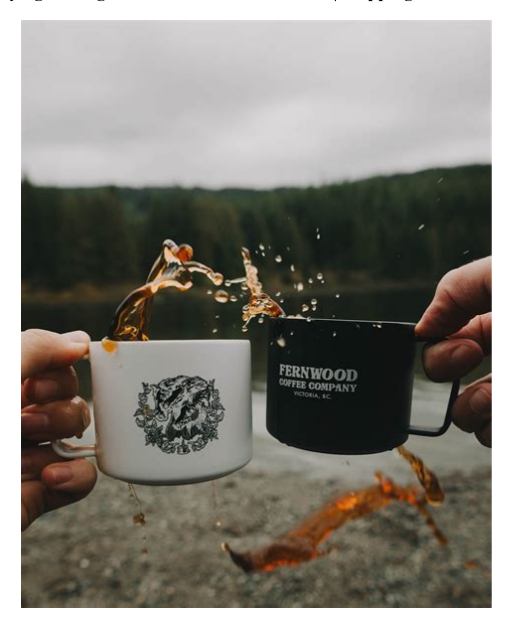
Step 4: Address Your Package. Please write the address parallel to the longest side of the package, and make sure your return address, the delivery address, and postage will fit on the same side. TIP: If you'll be printing a shipping label (with postage included), you can use that instead of a separate address label.