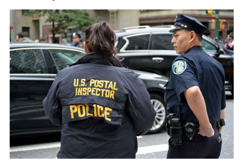
The U. S. Postal Service handles around 500 million pieces of mail every day. UPS and FedEx deliver 34 million packages combined. With the number of items being shipped and moved around the country.