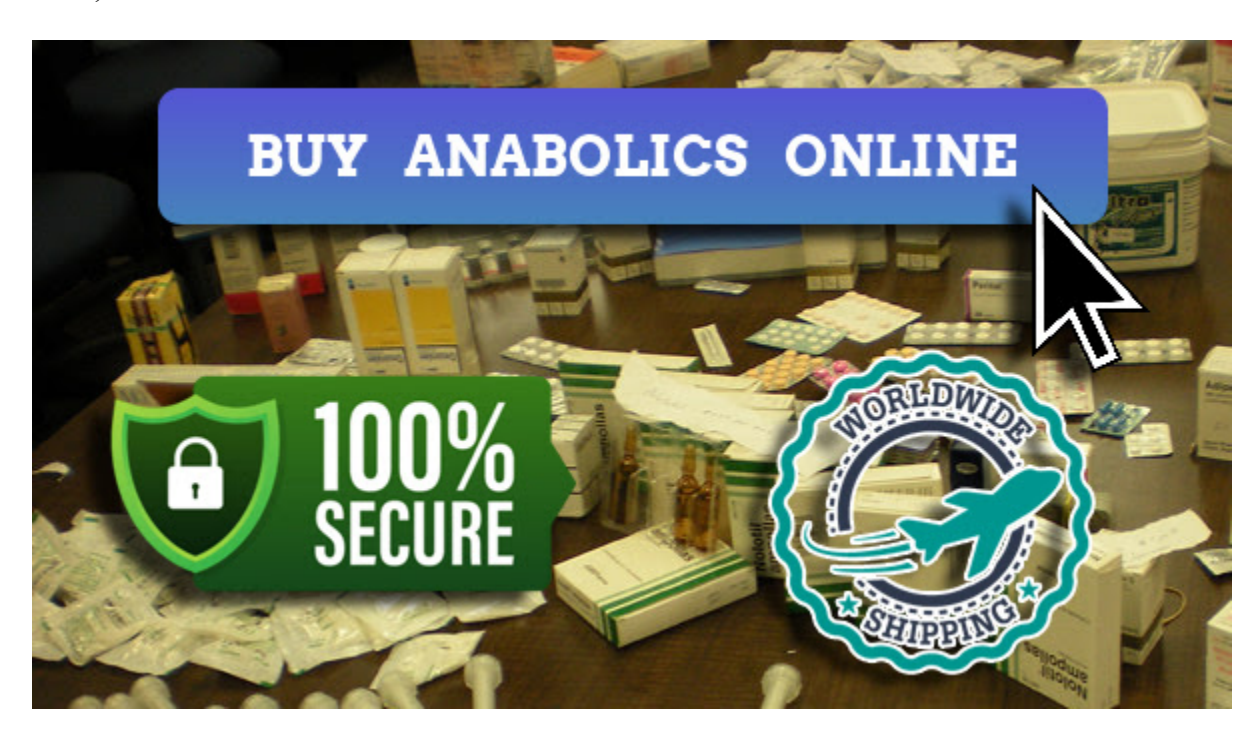
* * BUY STEROIDS ONLINE * *

Thus, the USPS must scan or x-ray packages to ensure both public and individual health and safety. Imagine if people every day were mailing loaded firearms or cases of poorly packed glass alcohol bottles. Scanning gives the USPS an additional layer of security over their legal prohibitions, which deter most, but not all. .