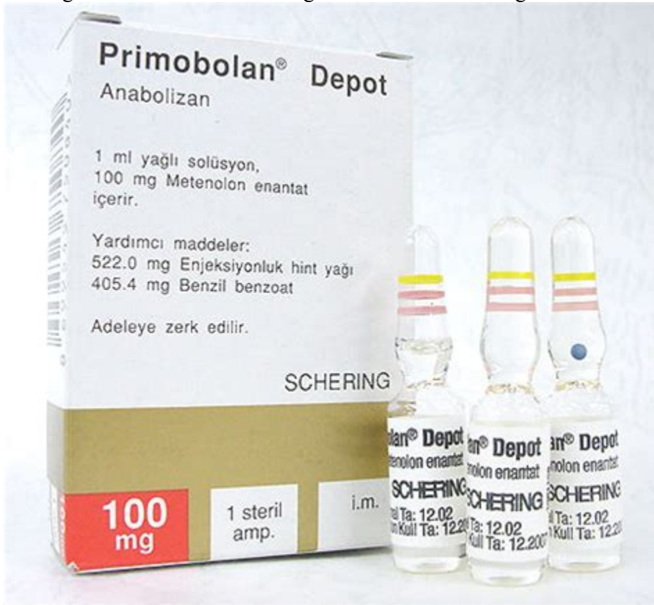
Inicio Esteroides anabólicos