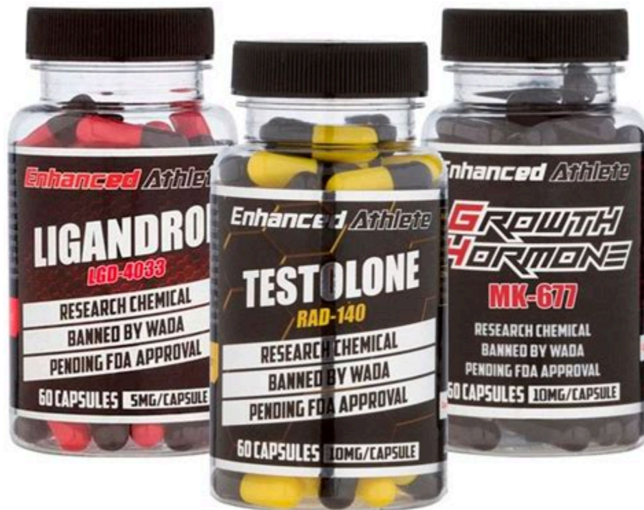
Figure 4: Both SARMS and Prohormones need to go through the first pass to be absorbed. That said, Prohormones are far worse for the liver than most SARMS. Superdrol, the most famous Prohormone, is known to be extremely liver toxic. It is also known to cause severe Androgenic side effects such as acne, hair loss, etc.