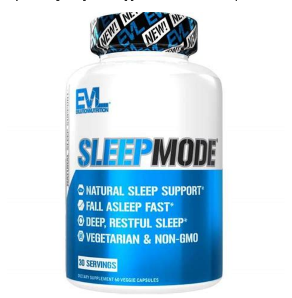
The 5 Best Bodybuilding Sleep Aid Supplements For Recovery

2 Sort by: Add a Comment BWallSports • 4 yr. ago I have a question. I am planning to start taking 1 andro. I currently have 1 andro, alpha af, ababolic, and rested all from the Steel line of products. I plan to use these accordingly through the cycle. My only worry is do I need an on cycle support?