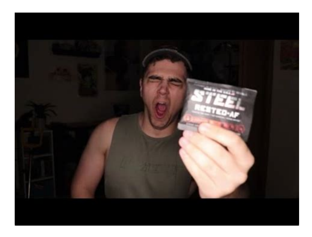
GABA - People with insomnia problems normally lack GABA in the brain. By adding this neurotransmitter in supplement form, nerve activity is decreased, allowing for better sleep. L-theanine - This substance has a calming effect, reducing the cortisol and epinephrine stress hormones, thereby allowing one to fall asleep.