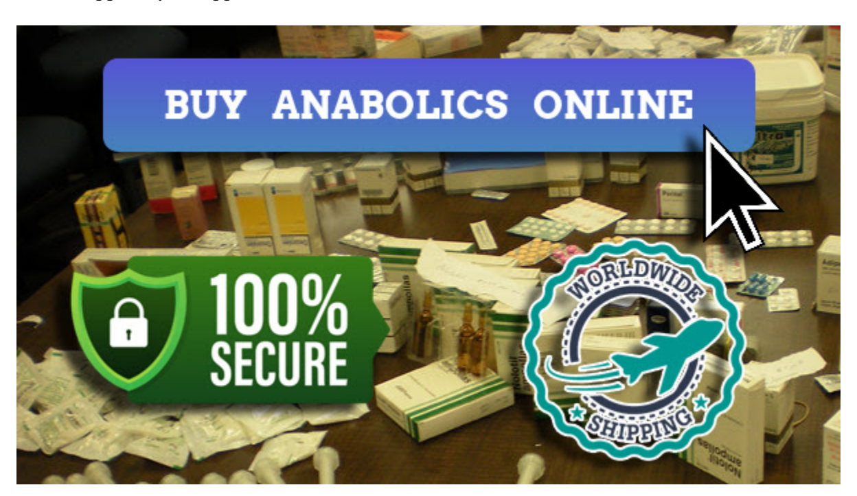
運運運 VISIT OUR SHOP 運運運

Shredded AF is a premium-quality formulation made using only the best, purest ingredients, formulated specifically using scientific research to deliver best-in-class results. Shredded AF is THE supplement that will help you: Mobilize stored excess body fat. Boost your metabolism and natural energy production. Suppress your appetite.