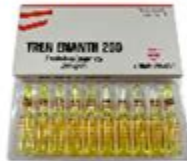
Tren Enanth 200