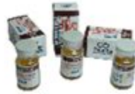
GP Tren Enanth 200 Manufacturer: Geneza Pharm...