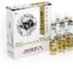
Tren-E 200 Manufacturer: Magnum Phar...