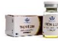
Tren E 200