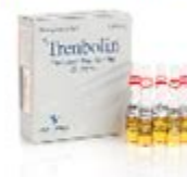
Trenbolin Manufacturer: Alpha-Pharma