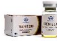
Tren E 200 Manufacturer: Maha Pharma