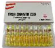
Tren Enanth 200 Manufacturer: Singal Pharma