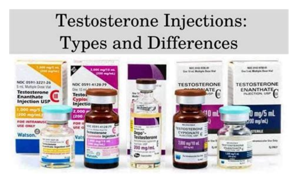
The 3 Types of Testosterone Injections: Which is the Most . - GoodRx

Find 17 user ratings and reviews for Testosterone Enanthate Intramuscular on WebMD including side effects and drug interactions, medication effectiveness, ease of use and satisfaction . but causes too much hemoglobin requiring 240 phylebotomies in 20 years of use. Testosterone cypionate crystalizes in 10 ml bottles whereas enanthate doesn't .